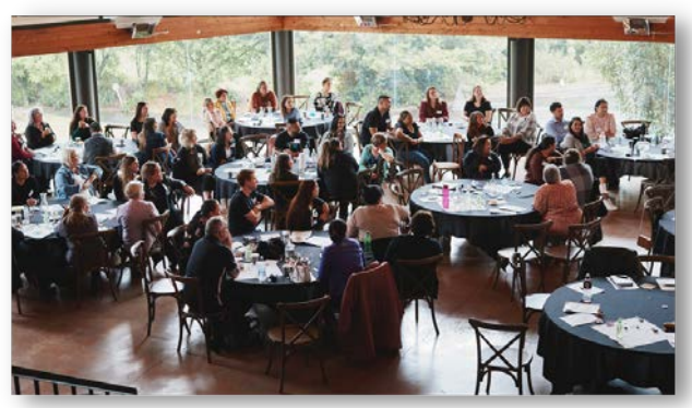
FCU Staff at the November training day

I would like to thank the members for allowing us to close our branches on this day to host the training.